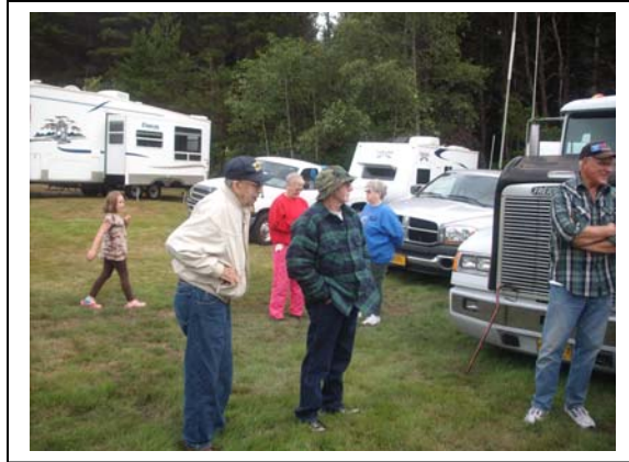
FROM 2010 O.E.N. PICNIC LEFT, K7ADW. CENTER N7IPG, FAR RIGHT W7BXD. IN BACK, N7RBH AND KE7GML