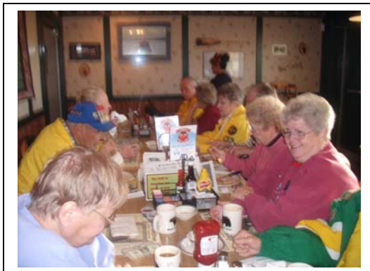
PICTURE: ARES BREAKFAST KLAMATH FALLS DEC. 25—comments pa 5