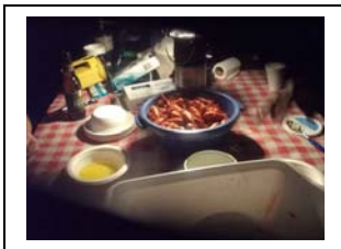
CRAWDADS BOILED AND SERVED AT TIMOTHY LAKE, NEAR MT. HOOD, OR.